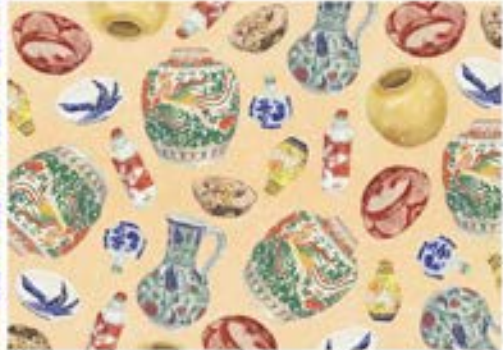
Merchandises mock up include cushion covers, mugs, plates and tote bags.